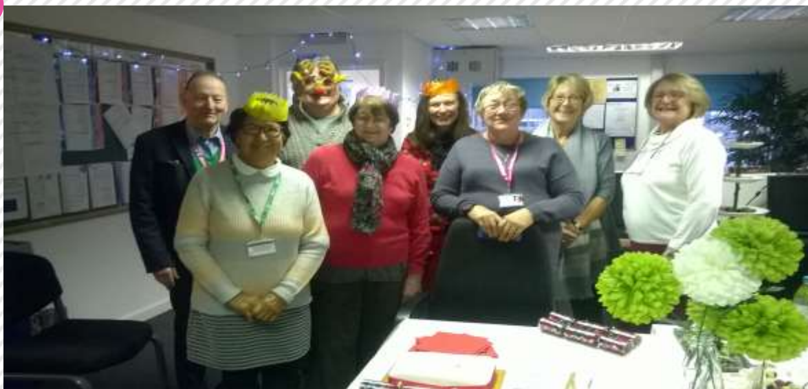
At our Healthwatch Portsmouth Volunteers' 2017 Christmas party !